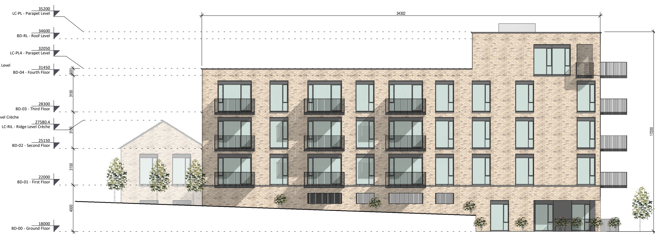
3 BD-West Elevation 1:200