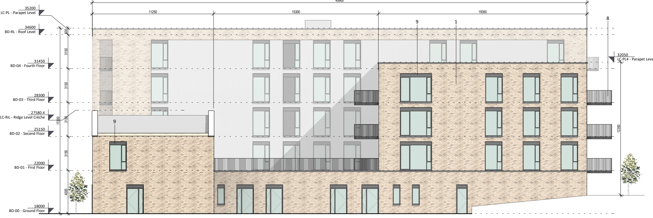
6 BD-North Elevation 1:200

All levels (in meters) are related to Malin head datum. All dimensions in millimeters. Figured dimensions only are to be taken from this drawing.