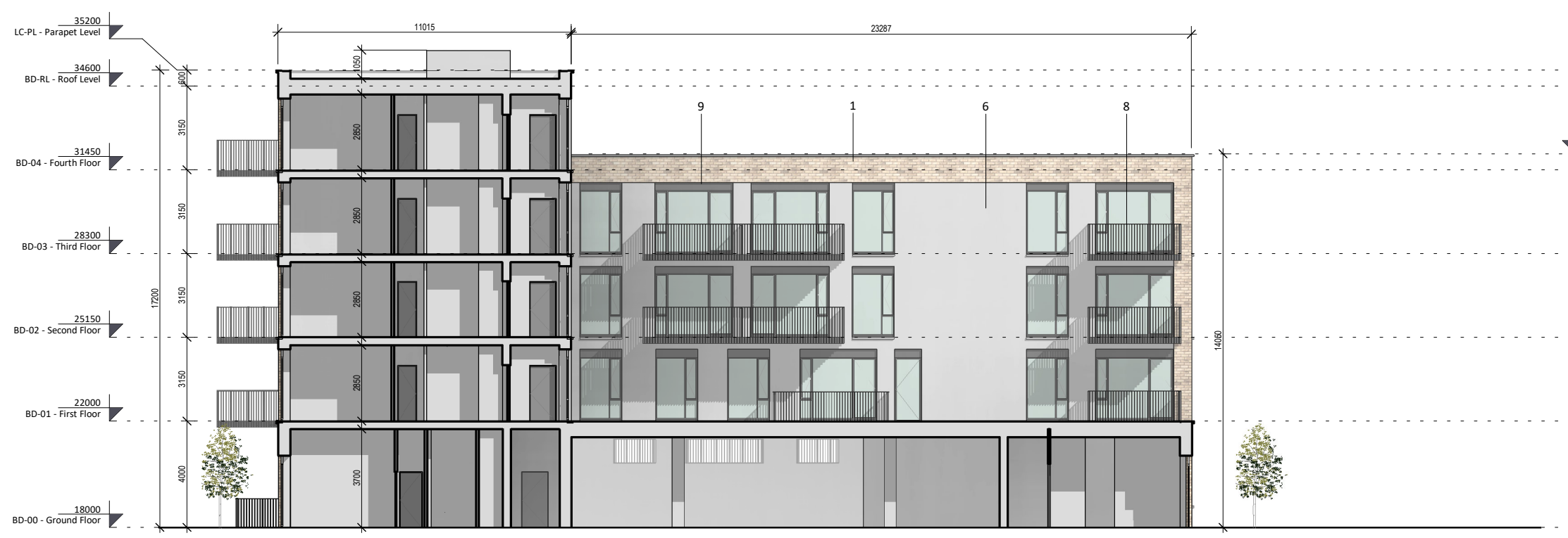
4 BD-Courtyard East Section/Elevation 1:200