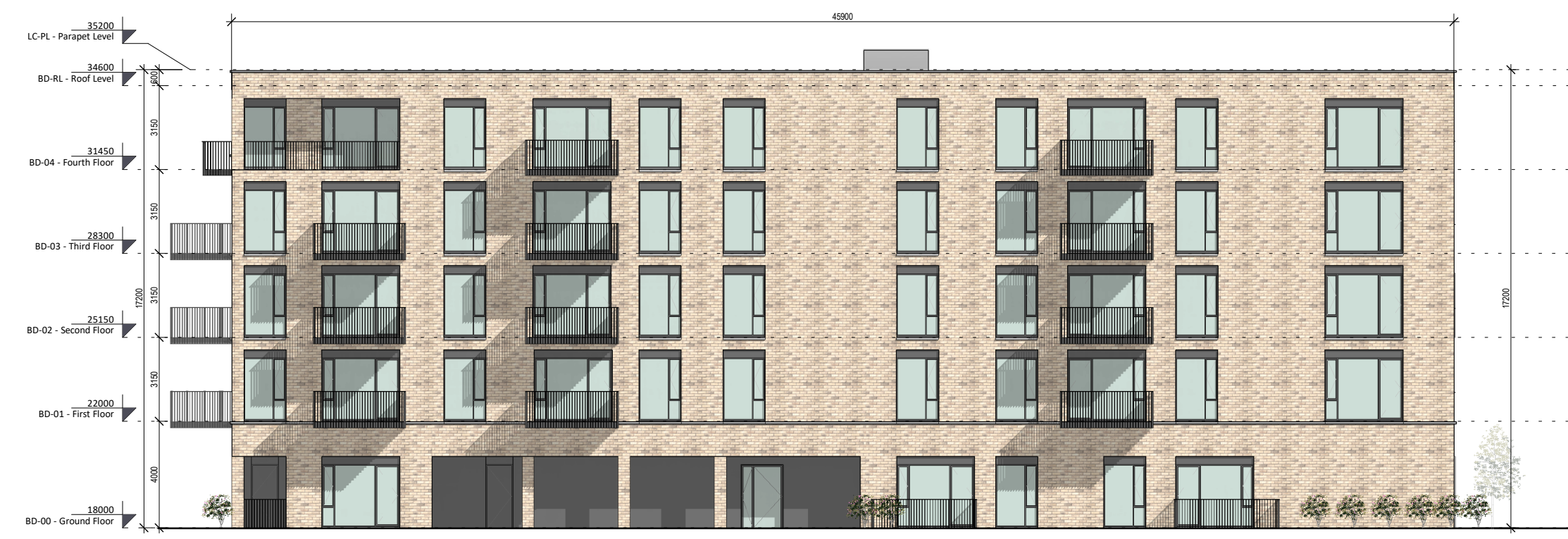
1 BD-South Elevation 1:200