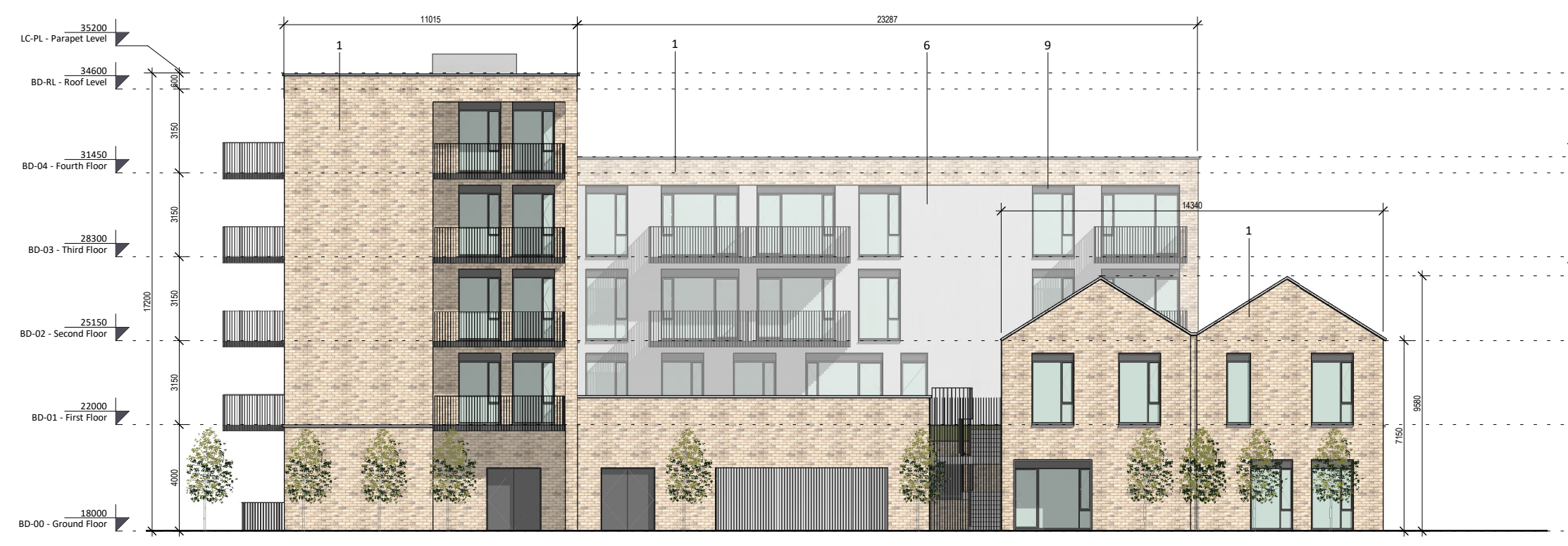
2 BD-East Elevation 1:200