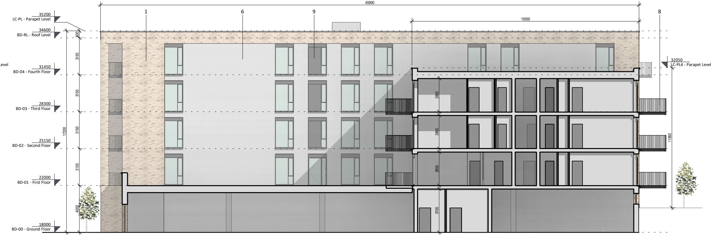
5 BD-Courtyard North Section/Elevation 1:200